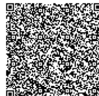
Baidu Map HOTEL TO MTR 酒店往港鐵站