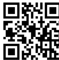
Google Map HOTEL TO MTR 酒店往港鐵站